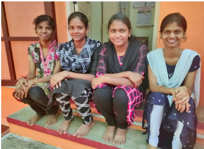
Diwali 'home-comers': from left