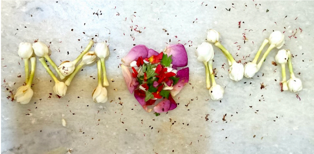
SOMEBODY PLAYED WITH FLOWERS IN THE PRAYER HALL :)