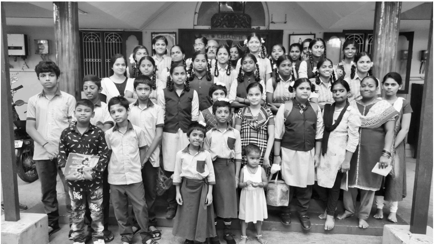
THE FIRST SCHOOL DAY ON 1 ST OF NOVEMBER 2021 FOR ALL CHILDREN. EVERYONE IS HAPPY TO GO TO SCHOOL!

Children took most of those pictures since they wanted to try out black-and-white photography. I guess they have done quite well.