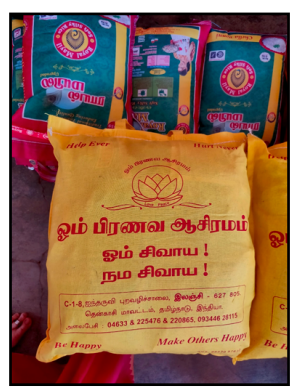
A bag of groceries...