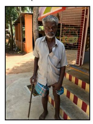
One of the 50 monthly financial beneficiaries