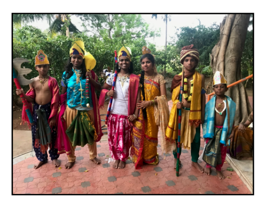
A Play [Scenes from Mahabharatham]