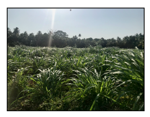
Cow grass cultivation