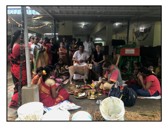
Mattupongal Pooja 2021