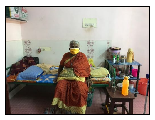
Elderly ashramites and other pictures with elders in the midst of ashram activities