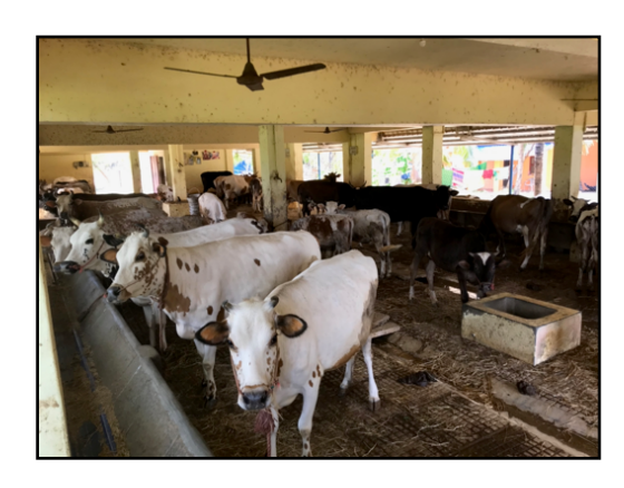
One half of the Goshala cows