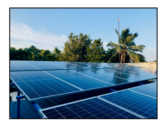
Solar panels on top of the Aum Pranava Building