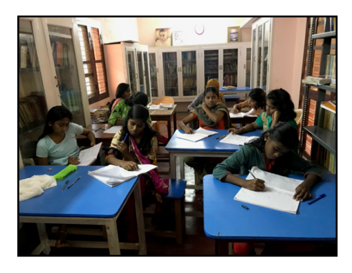
Afternoon studies in one of the four study halls-cum-library