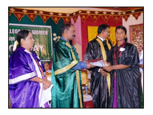
Convocation for one ashram girl