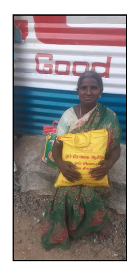
Distribution on a field tour