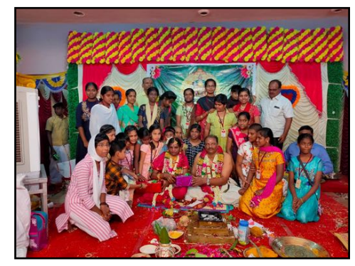
Marriage of an ashram member