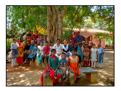
Group photo of children with founders and staff members inside the premises of the Ashram.