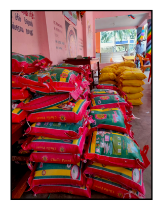
...and a bag of rice for each beneficiary during a charity program in 2021